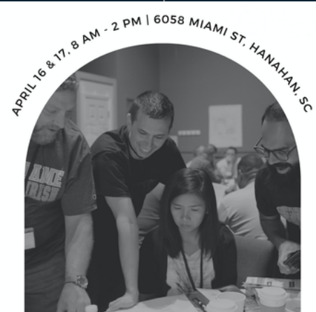
Register at: www.cypressproject.org/ event-registration

This 8-hour workshop will help your team look beyond the latest program to focus on establishing strong missional DNA in your church. Hosted by some of our partner churches. and led by Cypress alumni, you'll be learning directly from seasoned church planters who live out the "every man, woman, and child" vision. We'll explore foundational elements of Cypress to cultivate and contextualize the principles that will help your church make and mobilize missionary disciples.